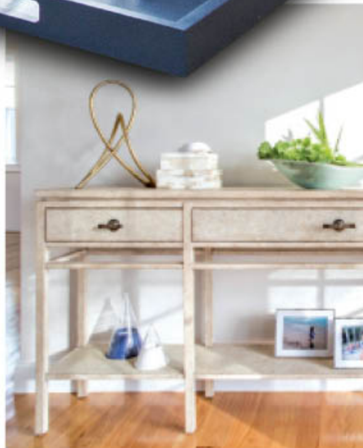
One of designer Angela Hamwey's favorite pieces, this console table has a light paint finish that gives some warmth without being too heavy in color tone. She also likes glass lamps with white shades and always a touch of gold, which adds sophistication without being too formal.

Designer Angela Hamwey of Mackenzie & Company, based on Cape Cod, says that she often suggests making spaces as open as possible by adding new windows or enlarging existing ones. "This provides a lot of natural light and also draws in the natural color palette of the outdoors," she says. "Go neutral on the big stuff," is Hamwey's second recommendation. Sofas, chairs, countertops and flooring, like whitewashed wood and sisal rugs, provide a clean backdrop for many color choices and trends.